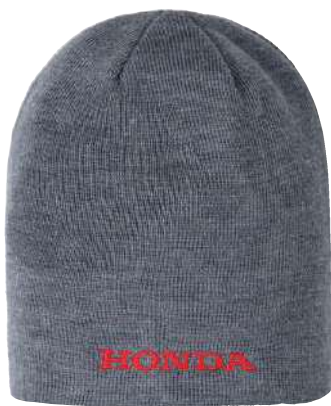
CORPO REVERSIBLE 243-0506042-03