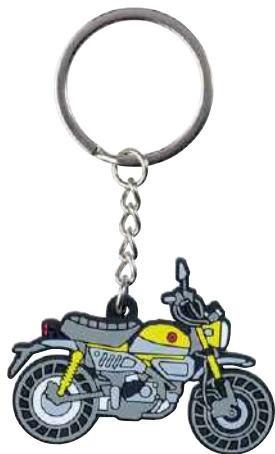
5cm MONKEY RUBBER 233-0601016