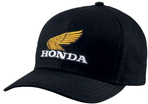
VINTAGE BLACK 243-7020060-11