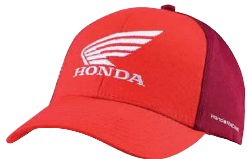
RACING RED 243-7020060-01