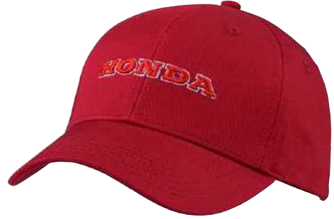
TOKYO RED 233-7020060-01