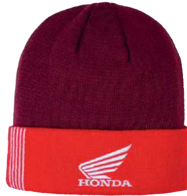
RED RACING 243-0506042-01