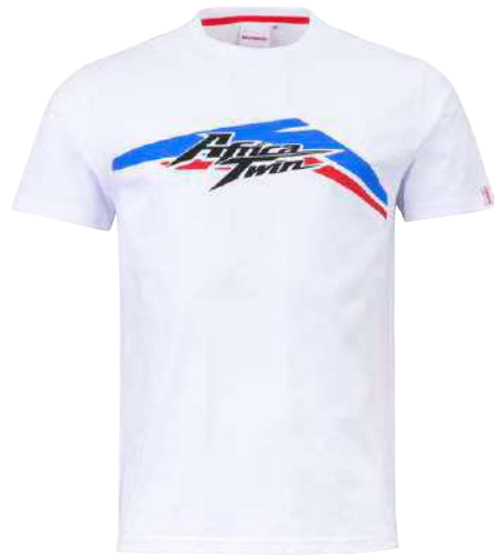
AFRICA TWIN WHITE 233-8820040-00