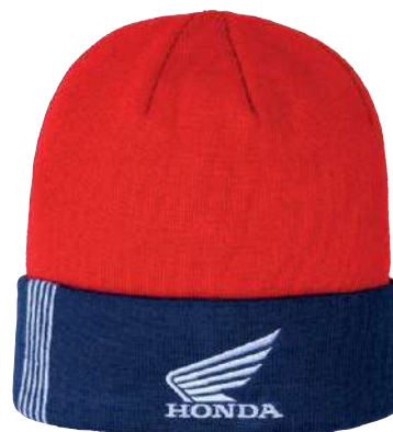
NAVY RED RACING 243-0506042-20