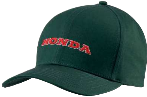
TOKYO GREEN 243-7020060-05