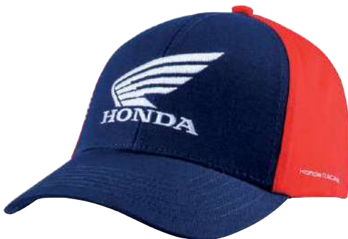
RACING NAVY 243-7020060-02