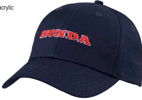
TOKYO DENIM 233-7020060-02