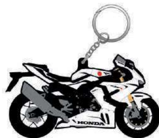
7cm CBR RUBBER 233-0601014