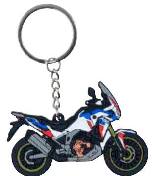
7cm AFRICA TWIN RUBBER 233-0601015