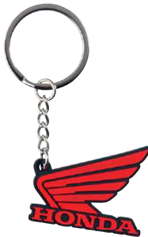
4cm WING RUBBER 233-0601013