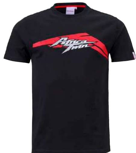
AFRICA TWIN BLACK 233-8820040-09